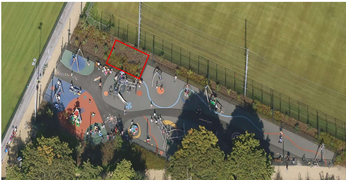
Site of the ability swing position (marked by red box) within the Grangegorman playground

The swing being installed is EN compliant to European standards, certified and fully accessible for wheelchairs and can accommodate two wheelchair users at a time.